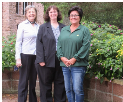
Health Information Management